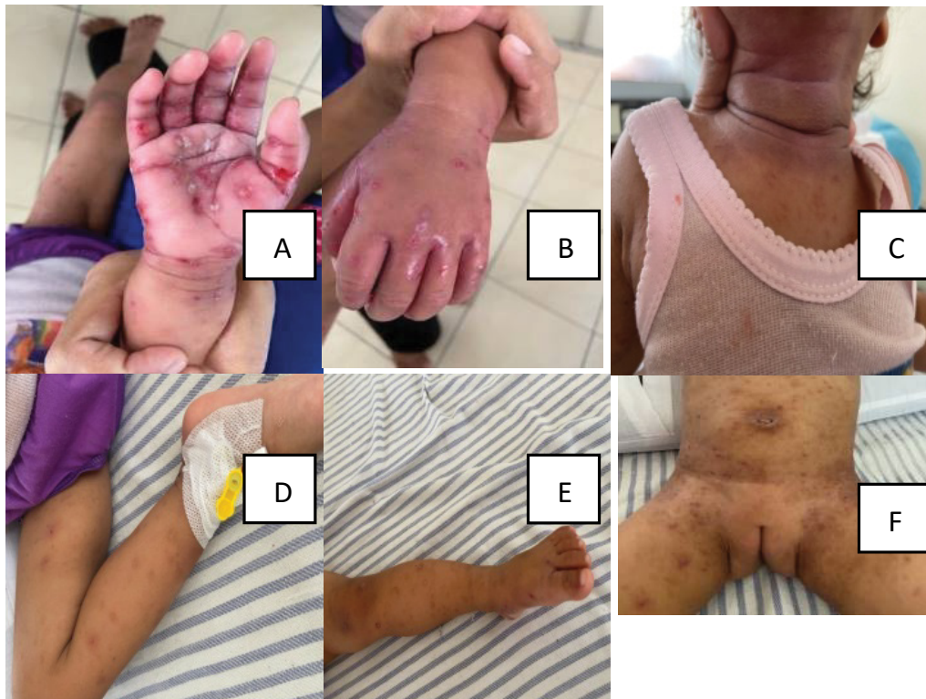
Figure 1: Before Treatment (A,B,C,D,E,F). Multiple pustules over erythematous skin accompanied by erosions, exudates, and edema.