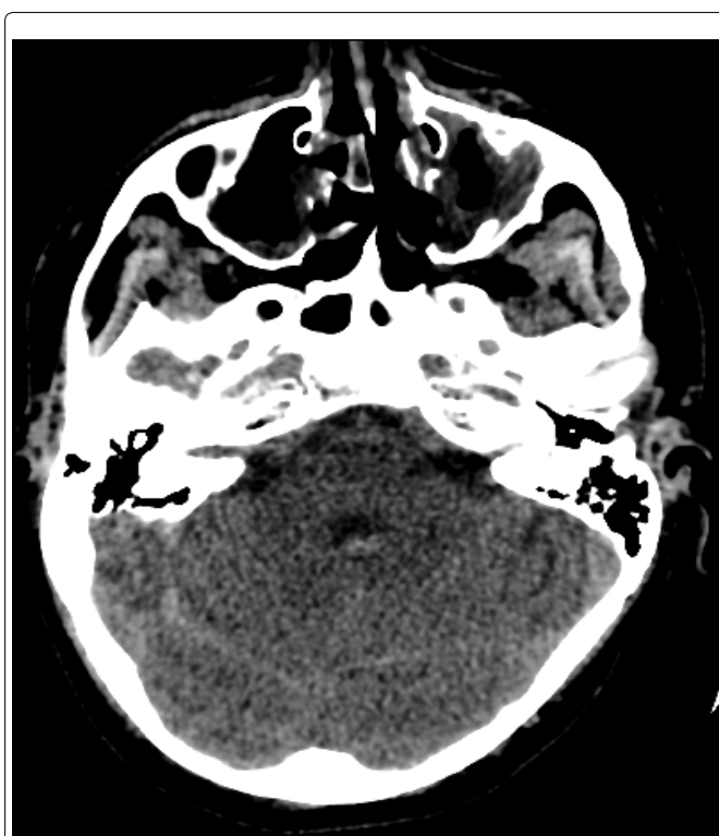
Figure 3: Cerebral CT-scan at day 5 : regression of intraventricular haemorrhage.